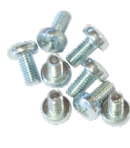
K-10 R2 screw kit