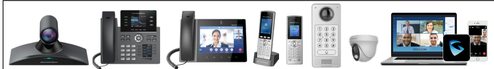
Internal Network Devices